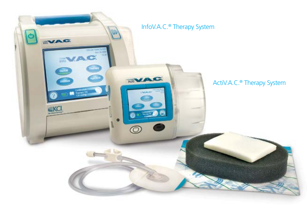
*Compared to V.A.C. ATS® Therapy System