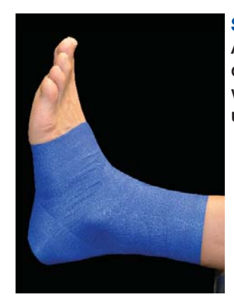
STEP 1: Apply PowerFlex directly to the skin with proper un-wind tension.

When placing an order, please state catalog # and color. Example ACP130BL. XX = Color Code.